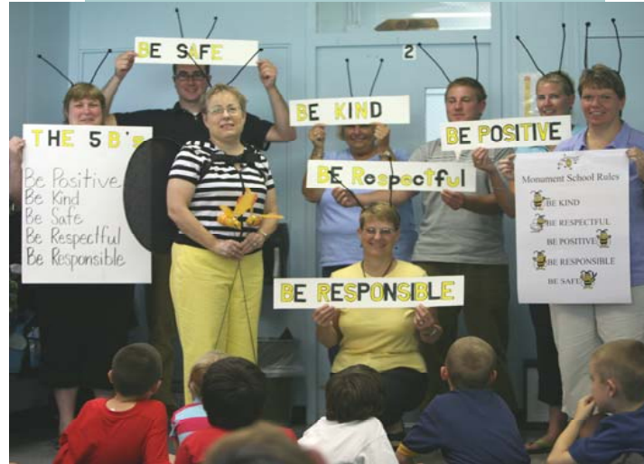
Monument Elementary, Bennington Vermont "Presenting expectations to students"

VTPBS has the greatest potential for bringing out the BEST in all of us.