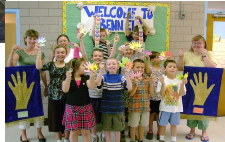
Bennington Elementary Bennington, Vermont School-Wide Roll Out!