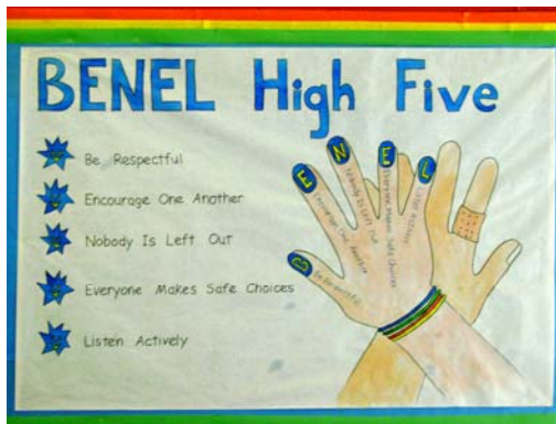
Bennington Elementary "High Five"

Vermont Positive Behavior Supports is a State-wide effort designed to help school teams form behavioral and discipline systems that support students learning and social development.