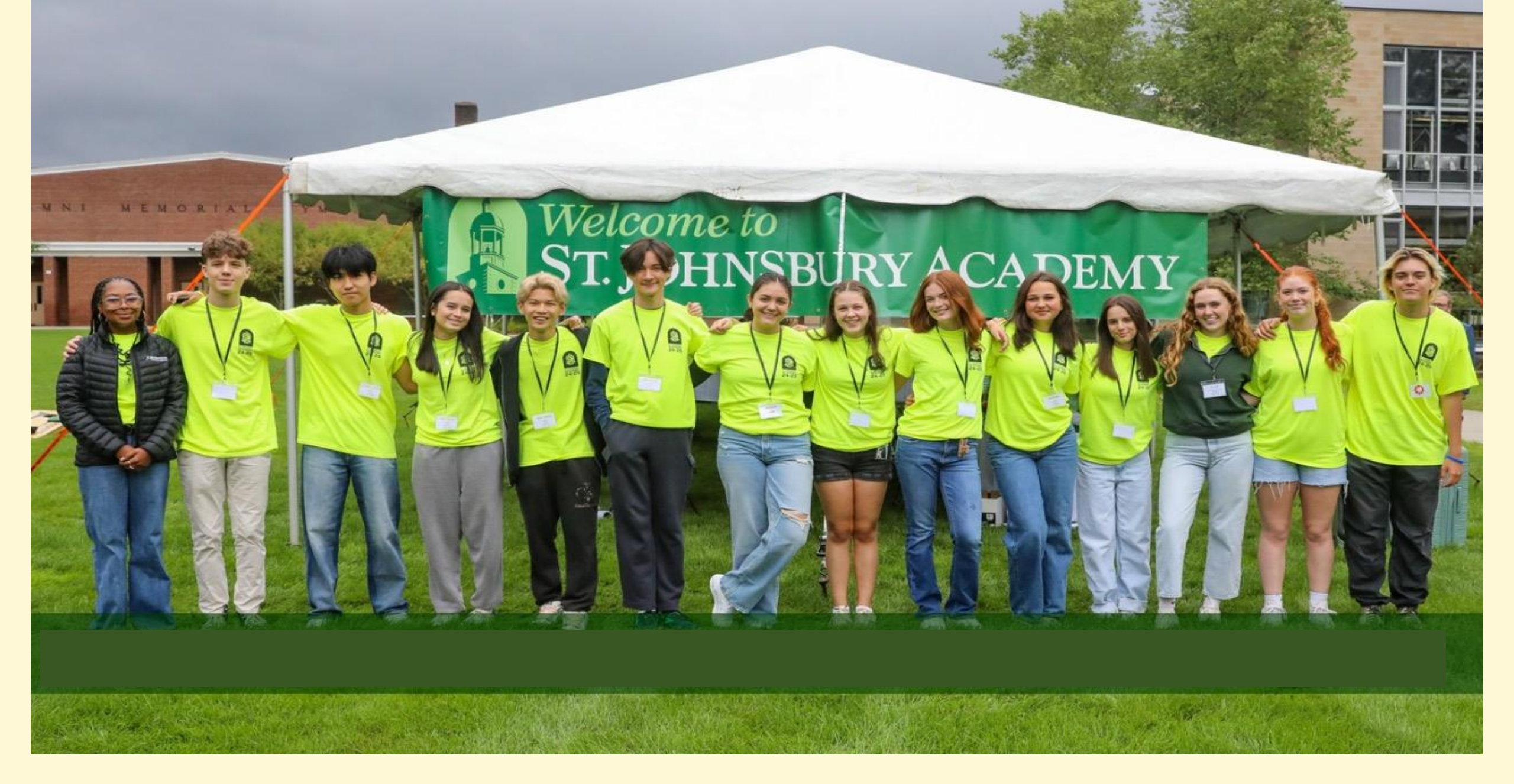
Countless Stories, One Community: We Are SJA