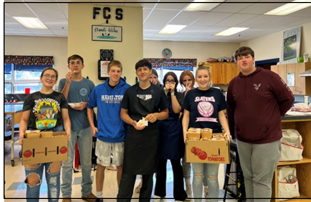
Family lunches and Students from Foods Class at Fair Haven Union Middle and High School prepare homemade dinners and deliver them to the local food shelf.