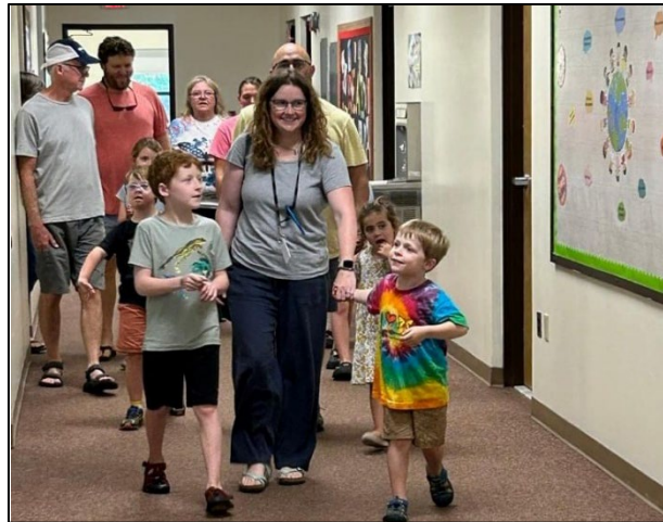
Fair Haven Grade School's Monthly Falcon Awards Assembly and Open House.