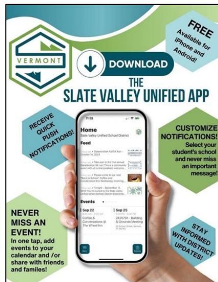
Slate Valley Unified App