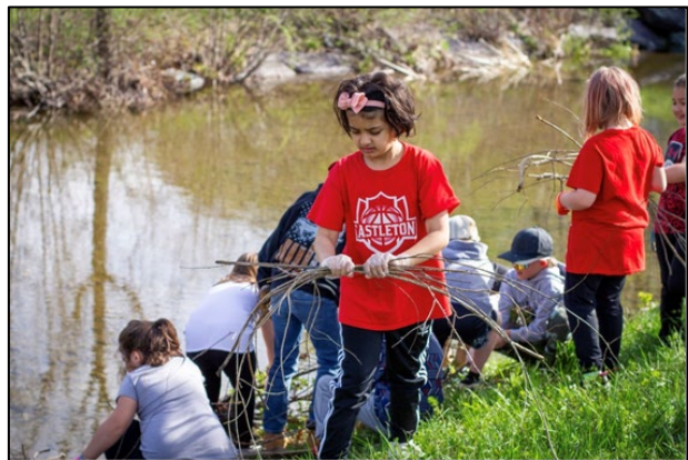
Castleton Elementary School provides community service during Green Up Day.