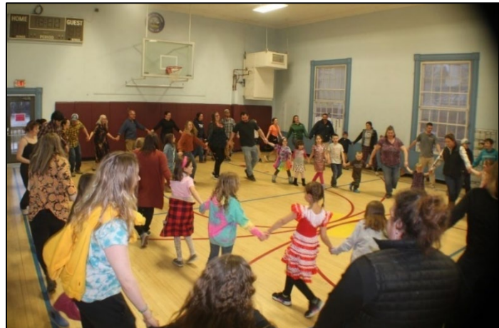
Benson Village School's Annual Bike N' Groove and Orwell Village School's Community Folk Dance Night